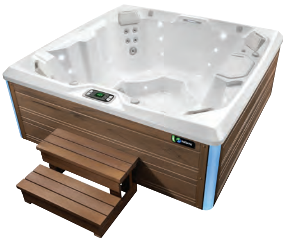
Beam shown with Alpine White shell and Sable cabinet