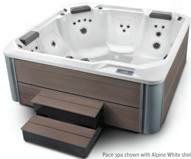
Pace spa shown with Alpine White shell, Havana cabinet and Havana Hot Spot Collection Step.