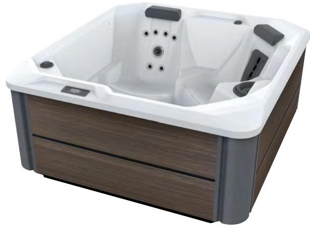
SX spa shown with Alpine White shell and Havana cabinet.