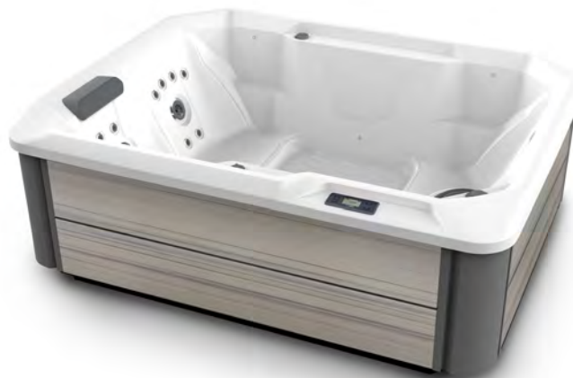
Stride spa shown with Alpine White shell and Almond cabinet.